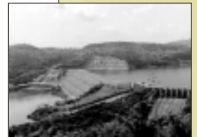
Figure 12 – Akosombo hydro station, Ghana, site of a major retrofit.

For your electric power needs, consider Canada!