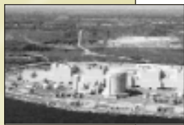
Figure 2 - Darlington Generating Station in Ontario.