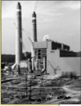
Figure 4 – Suralaya Station, Indonesia, expansion project by Babcock & Wilcox.