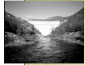
Figure 10 – In Bosnia-Herzegovina, Acres serves as engineer in the reconstruction of war-damaged generation, transmission and distribution facilities.

Canadian consulting engineers and contractors, as well as companies such as Hydro-Québec International, are active internationally in providing a full range of consulting services for power station rehabilitation. Canadian advanced products in this area range from robotic repair and maintenance units, to diagnostic and control systems, generation scheduling and river management software.