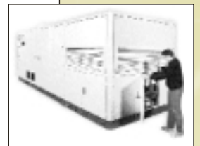
Figure 8 – Ballard Generation System's 250 kW natural gas-powered Fuel Cell Power Plant.