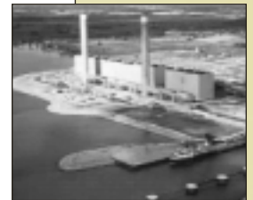
Figure 3 – Ontario Power Generation's Nanticoke generating station.

Canada's experience features major power development projects using hydro, nuclear and thermal energy sources