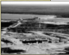
Figure 9 - Manitoba Hydro's Radisson Converter Station in northern Manitoba, with Kettle Generating Station in the background. Radisson is one of two stations converting electricity produced at Manitoba Hydro's three Nelson River Generating Stations from AC to DC, transmitting by HVDC up to 3850 MW of power to Winnipeg at +/- 500 kV, where it is converted back to AC for distribution to the 230 kV distribution system.

State-of-the-art transmission, distribution and management for deregulated networks, from pioneers of high voltage transmission