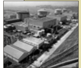
Figure 7 – The Wolsong nuclear generating station in the Republic of Korea, with four AECL-designed CANDU6 units, was completed in 1999.