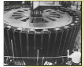
Figure 6 – Guri 2, Venezuela. The world's largest air-cooled hydro generator, built in Canada by GE Hydro.

Other generation technologies that possess considerable environmental advantages are emerging in Canada. Examples include wind power, photovoltaics and fuel cells. Some of these emerging technologies are also well suited to fill growing requirements for distributed generation and customized energy services. This is very much the case for Ballard Generation System's 250 kW natural gas-powered Fuel Cell Power Plant for stationary power applications. There is a growing fuel cell industry including such companies as Global Thermoelectric, a leader in solid oxide fuel cell technology, and Hydrogenics Corporation, a developer of fuel cell power generators and test equipment.