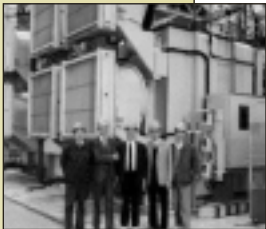
Figure 5 – Transformers for Geheyuan Hydropower Station, China, manufactured by ABB Canada.

Globally competitive companies, whose $6.2 billion in shipments (1997) include $4.1 billion in exports